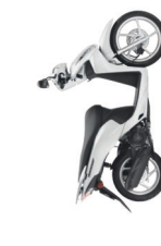
VISION 110 A1 LICENCE Power Output: 9.7 HP Seat Height: 770 mm Fuel Tank Capacity: 5.2 L Fuel Consumption: 146.9 mpg Kerb Weight: 102 kg