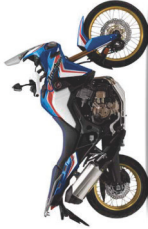
CRF1000L AFRICA TWIN / DCT A LICENCE Power Output: 93.9 HP Seat Height: 800 / 850 mm Fuel Tank Capacity: 16.2 L Fuel Consumption: 61.3 mpg Kerb Weight: 232 kg