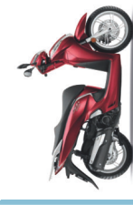
SH300i A2 LICENCE Power Output: 24.8 HP Seat Height: 805 mm Fuel Tank Capacity: 9.0 L Fuel Consumption: 141.2 mpg Kerb Weight: 169 kg