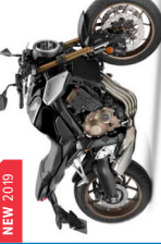
NC750S / DCT A LICENCE Power Output: 54.0 HP Seat Height: 790 mm Fuel Tank Capacity: 14.1 L Fuel Consumption: 80.8 mpg Kerb Weight: 207 kg