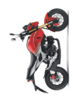
MSX125 A1 LICENCE Power Output: 9.7 HP Seat Height: 765 mm Fuel Tank Capacity: 5.5 L Fuel Consumption: 185 mpg Kerb Weight: 107 kg