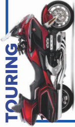
GL1800 GOLD WING TOUR / DCT A LICENCE Power Output: 124.7 HP Seat Height: 745 mm Fuel Tank Capacity: 21.1 L Fuel Consumption: 50.4 mpg Kerb Weight: 379 kg