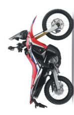
CRF250L RALLY A2 LICENCE Power Output: 24.4 HP Seat Height: 895 mm Fuel Tank Capacity: 10.1 L Fuel Consumption: 94.1 mpg Kerb Weight: 157 kg