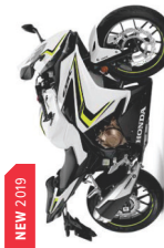
CBR500R A2 LICENCE Power Output: 46.9 HP Seat Height: 785 mm Fuel Tank Capacity: 17.1 L Fuel Consumption: 83.0 mpg Kerb Weight: 192 kg