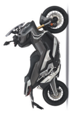
NC750X / DCT A LICENCE Power Output: 54.0 (47) HP Seat Height: 830 mm Fuel Tank Capacity: 14.1 L Fuel Consumption: 80.8 mpg Kerb Weight: 220 kg