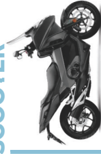
INTEGRA DCT A LICENCE Power Output: 54.0 (47) HP Seat Height: 790 mm Fuel Tank Capacity: 14.1 L Fuel Consumption: 103 mpg Kerb Weight: 238 kg