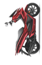
PCX125 A1 LICENCE Power Output: 12 HP Seat Height: 764 mm Fuel Tank Capacity: 11.5 L Fuel Consumption: 134.5 mpg Kerb Weight: 130 kg