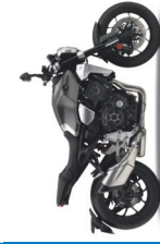
CB1100RS A LICENCE Power Output: 88.5 HP Seat Height: 795 mm Fuel Tank Capacity: 16.8 L Fuel Consumption: - Kerb Weight: 252 kg