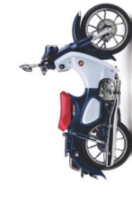
SUPER CUB 125 A1 LICENCE Power Output: 9.5 HP Seat Height: 780 mm Fuel Tank Capacity: 3.7 L Fuel Consumption: 188.4 mpg Kerb Weight: 109 kg