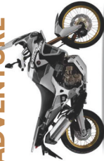
CRF1000L AFRICA TWIN A LICENCE Power Output: 93.9 HP Seat Height: 800 / 850 mm Fuel Tank Capacity: 16.2 L Fuel Consumption: 61.3 mpg Kerb Weight: 232 kg