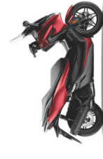
FORZA 125 A1 LICENCE Power Output: 17 HP Seat Height: 780 mm Fuel Tank Capacity: 11.5 L Fuel Consumption: 172.8 mpg Kerb Weight: 159 kg