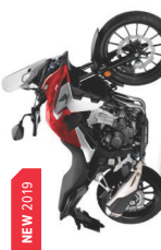
CRF450L A2 LICENCE Power Output: 24.4 HP Seat Height: 895 mm Fuel Tank Capacity: 10.1 L Fuel Consumption: 94.1 mpg Kerb Weight: 157 kg