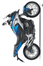
NC750X / DCT A LICENCE Power Output: 54.0 (47) HP Seat Height: 830 mm Fuel Tank Capacity: 14.1 L Fuel Consumption: 80.8 mpg Kerb Weight: 220 kg