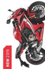
CBR650R A/A2 LICENCE Power Output: 93.9 (47) HP Seat Height: 80 mm Fuel Tank Capacity: 15.4 L Fuel Consumption: 57.6 mpg Kerb Weight: 207 kg