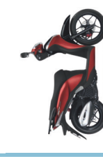
SH MODE 125 A1 LICENCE Power Output: 11.3 HP Seat Height: 765 mm Fuel Tank Capacity: 5.5 L Fuel Consumption: 141.2 mpg Kerb Weight: 116 kg