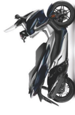
FORZA 300 A2 LICENCE Power Output: 24.8 HP Seat Height: 780 mm Fuel Tank Capacity: 11.5 L Fuel Consumption: 176 mpg Kerb Weight: 182 kg