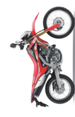
CRF250L RALLY A2 LICENCE Power Output: 24.4 HP Seat Height: 895 mm Fuel Tank Capacity: 10.1 L Fuel Consumption: 94.1 mpg Kerb Weight: 157 kg