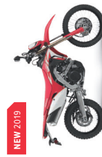
CRF450L A2 LICENCE Power Output: 24.4 HP Seat Height: 895 mm Fuel Tank Capacity: 10.1 L Fuel Consumption: 94.1 mpg Kerb Weight: 157 kg