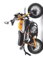
MONKEY 125 A1 LICENCE Power Output: 9.3 HP Seat Height: 776 mm Fuel Tank Capacity: 5.6 L Fuel Consumption: 189.2 mpg Kerb Weight: 107 kg