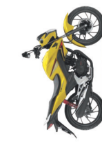
CB125F A1 LICENCE Power Output: 10.5 HP Seat Height: 775 mm Fuel Tank Capacity: 13.0 L Fuel Consumption: 144.9 mpg Kerb Weight: 128 kg