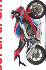
CBR1000RR FIREBLADE SP A LICENCE Track focused. Race derived. Road legal