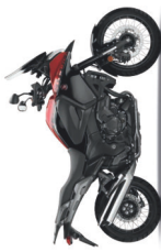
VFR1200X CROSSRUNNER A LICENCE Power Output: 104.6 HP Seat Height: 835 / 815 mm Fuel Tank Capacity: 20.8 L Fuel Consumption: 53.1 mpg Kerb Weight: 242 kg