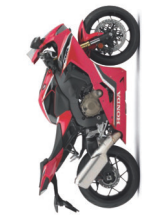
CBR1000RR FIREBLADE A LICENCE Power Output: 181 HP Seat Height: 832 mm Fuel Tank Capacity: 16.0 L Fuel Consumption: 41.2 mpg Kerb Weight: 196 kg