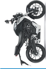
CMX500 REBEL A2 LICENCE Power Output: 45.6 HP Seat Height: 690 mm Fuel Tank Capacity: 17.2 L Fuel Consumption: 72.4 mpg Kerb Weight: 190 kg