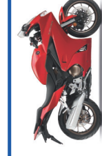
VFR800F A LICENCE Power Output: 104.4 HP Seat Height: 799 / 740 mm Fuel Tank Capacity: 21.5 L Fuel Consumption: 54.8 mpg Kerb Weight: 242 kg