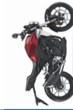
CB500F A2 LICENCE Power Output: 45.9 HP Seat Height: 785 mm Fuel Tank Capacity: 17.1 (lit. (ecovox)) Fuel Consumption: 83.0 mpg Kerb Weight: 189 kg