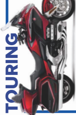
GL1800 GOLD WING TOUR / DCT A LICENCE Power Output: 124.7 HP Seat Height: 745 mm Fuel Tank Capacity: 21.1 L Fuel Consumption: 50.4 mpg Kerb Weight: 379 kg