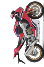
CBR1000RR FIREBLADE SP A LICENCE Power Output: 181 HP Seat Height: 820 mm Fuel Tank Capacity: 16.0 L Fuel Consumption: 41.2 mpg Kerb Weight: 195 kg