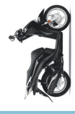
SH125i A1 LICENCE Power Output: 12 HP Seat Height: 799 mm Fuel Tank Capacity: 7.5 L Fuel Consumption: 133.9 mpg Kerb Weight: 138.7 kg