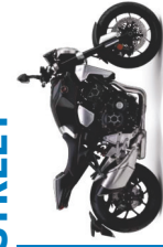
CB1000R A LICENCE Power Output: 143.5 HP Seat Height: 830 mm Fuel Tank Capacity: 16.2 L Fuel Consumption: 45.6 mpg Kerb Weight: 222 kg