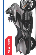
GL1800 GOLD WING A LICENCE Power Output: 124.7 HP Seat Height: 745 mm Fuel Tank Capacity: 21.1 L Fuel Consumption: 50.4 mpg Kerb Weight: 385 kg