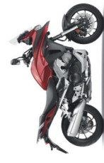
VFR1200X CROSSRUNNER A LICENCE Power Output: 104.6 HP Seat Height: 835 / 815 mm Fuel Tank Capacity: 20.8 L Fuel Consumption: 53.1 mpg Kerb Weight: 242 kg