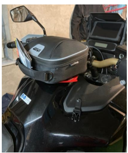
Full Turn ©