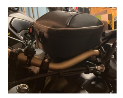
Have Fun, and drive safely <sup>◎</sup>!